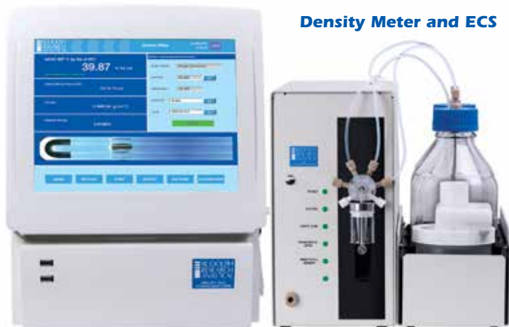
Density Meter and ECS