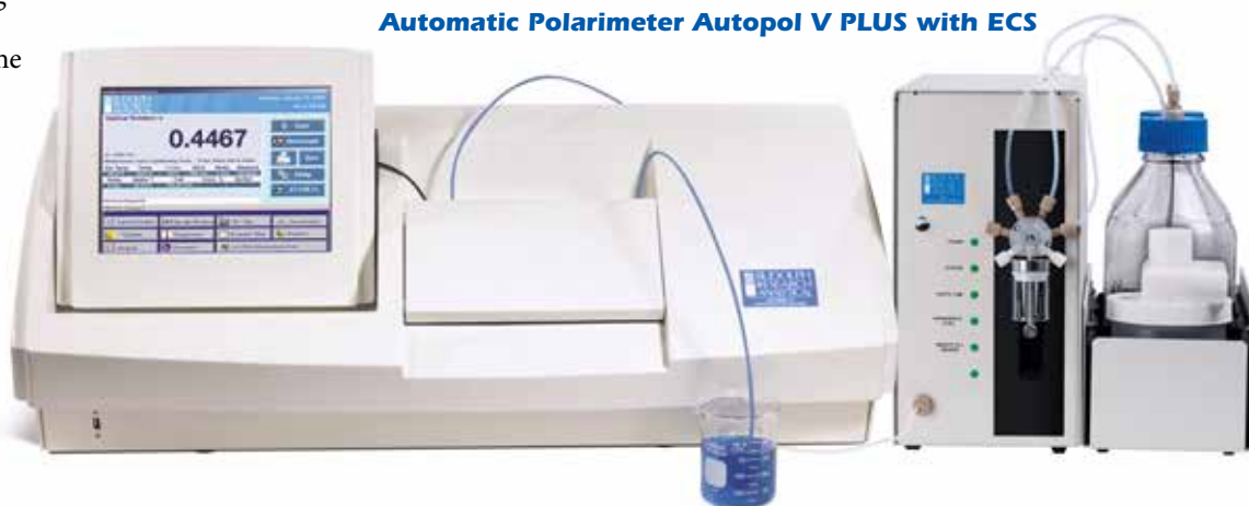
Automatic Polarimeter Autopol V PLUS with ECS